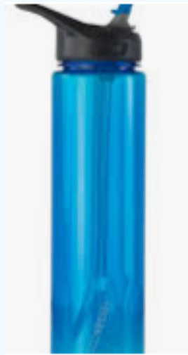
Water bottle. Freshly filled and named bottle.