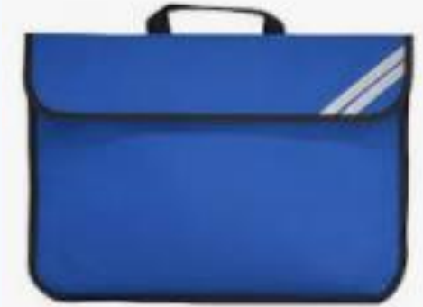
Book bag containing sunhat, reading folder and library folder