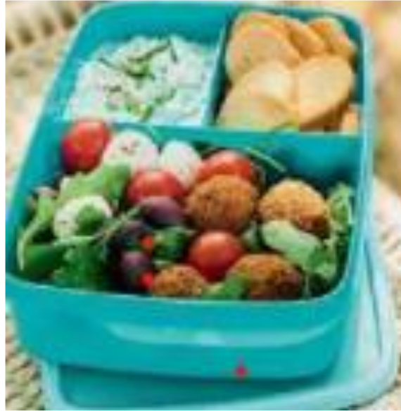
Healthy lunch box